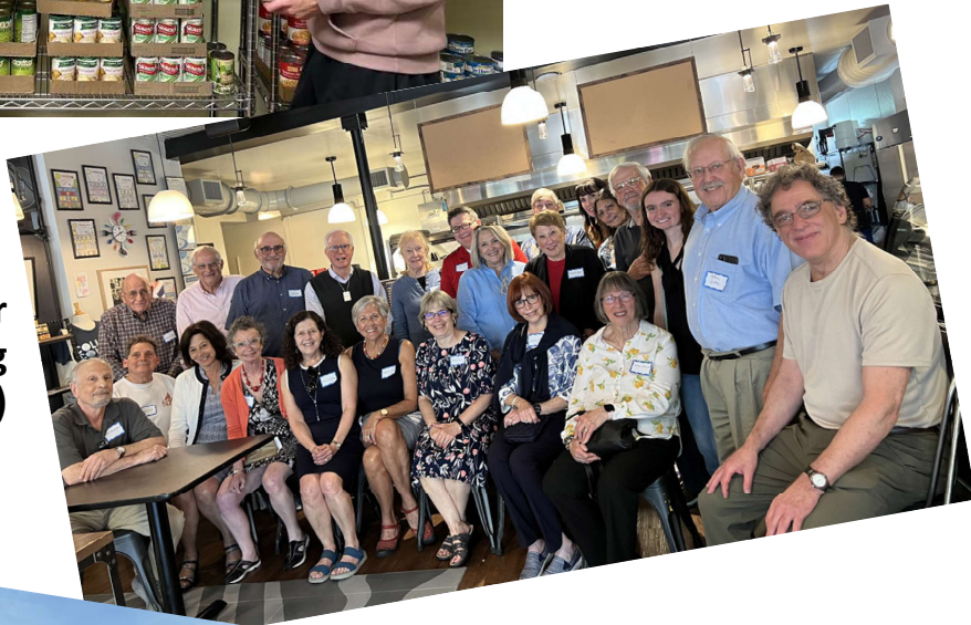
Volunteer Gathering (Spring 2024)